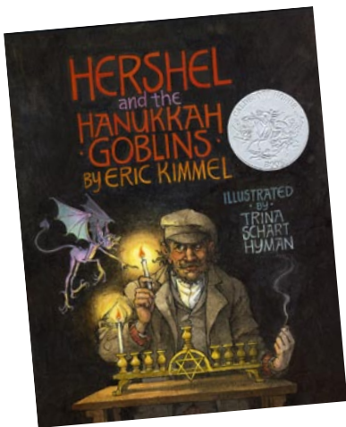
From Hershel and the Hanukkah Goblins