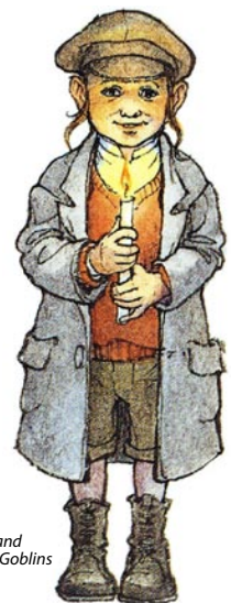
From Hershel and the Hanukkah Goblins