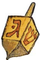
From Hershel and the Hanukkah Goblins

S L G F C N C H Z S A H A O P V A O S R N C A T B K R X H A G E M M K L S N Q N T N E U M E I P J G C A N D L E S N C T C A O R F Q S M S M H D R E I D E L H B T G A I D R J P U G Y A H H E R S H E L