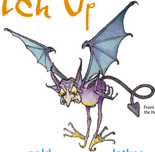
From Hershel and the Hanukkah Goblins

Fill in the blanks with the correct words from the list.