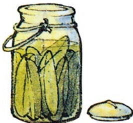
From Hershel and the Hanukkah Goblins

Celebrate Hanukkah with Hershel and the Hanukkah Goblins by Eric A. Kimmel , illustrated by Trina Schart Hyman .