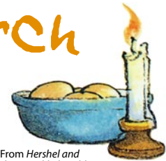
From Hershel and the Hanukkah Goblins

Find and circle these words in the puzzle below! They can be forward, across, down, or diagonal.