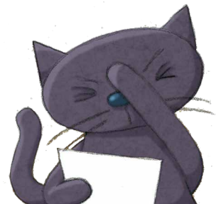
Illustrations © 2020 by Kevan Alteberry from Dear Beast.

Email marketing@holidayhouse.com a picture/scan of your completed bingo card and your mailing address to receive a certificate and a prize.