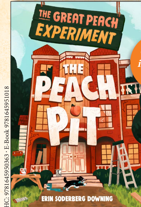
The Great Peach Experiment 2: The Peach Pit

“Simply sparkles with life.”—Kirkus Reviews