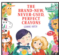
The Brand-New, Never-Used, Perfect Crayons by Leanne Hatch