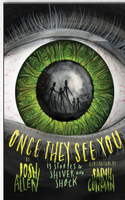
Once They See You: 13 Stories to Shiver and Shock HC: 9780823456321 · e-Book: 9780823459278