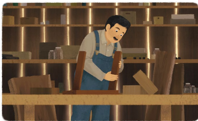
Illustration © 2024 by Toshiki Nakamura from Listening to Trees by Holly Thompson